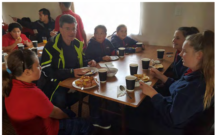
Treaty Negotiations Minister Chris Finlayson has breakfast with Raetihi Primary School prefects and te reo Māori students.