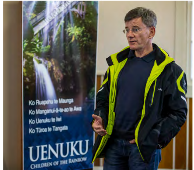
Minister Finlayson spent a day with the Negotiations Team, Wai Claimants, kuia and koroua, UCT trustees and members of the Te Korowai o Wainuiārua claimant community to hear their aspirations for redress.

The Negotiations Team will meet with Minister Finlayson again next month to talk in detail about some of the unusual and unique factors impacting upon Uenuku, Tamakana and Tamahaki and to present a detailed ‘aspirations for redress’ package.