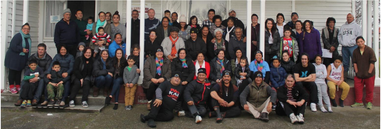
FULL HOUSE: Uenuku whānau in the deep South turned out in force for the Uenuku roadshow presentation at Te Whānau o Hokonui Marae in Gore.

PO Box 102, Raetihi ♦ 06 385 4900 ♦ enquiries@uenuku.iwi.nz ♦ Facebook and Website: www.uenuku.iwi.nz