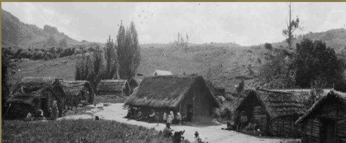
Ūtapu Parinui Marae